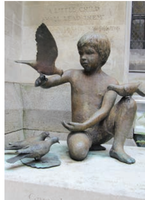
DETAIL FROM THE MEMORIAL FOUNTAIN

through the years names of other major contributors have been added.