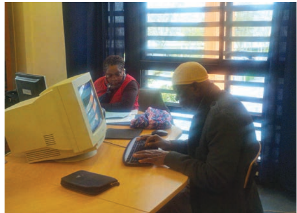
IMMIGRANTS CAN TAKE A STEP INTO THE VIRTUAL WORLD

When you're asked to help strengthen our community, just say yes