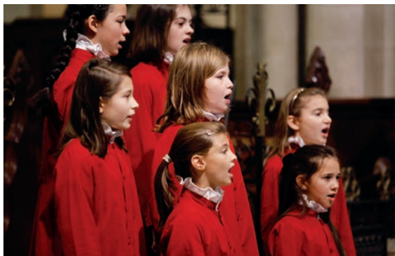
ILLUSTRATIONS FROM THE FRIENDS BROCHURE: THE CHILDRENS CHOIR

They are natives of virtually every state and several foreign countries. They lived in Paris for months, years, decades – or maybe never. They now live in Minnesota, Tennessee, New York, Texas, England, Hong Kong, or maybe somewhere else. Wherever that is, they are probably parishioners at a church there and often very active leaders in their congregations. Their last visit to the Cathedral may have been last week, or maybe it was 20 years ago.