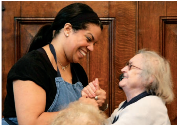
ILLUSTRATIONS FROM THE FRIENDS BROCHURE: PICTURES FROM A FAMILY ALBUM

up to $10,000 in many years. Secondly, Friends bring in visitors and new parishioners. Very often newcomers at the Cathedral will relate that they came because a friend of theirs (and a Friend of ours) told them they couldn't visit (or live in) Paris without coming to the Cathedral. Thirdly, many Friends serve in volunteer roles in other bodies related to the Cathedral, such as the Board of Foreign Parishes, which is the legal owner of our building; the American Cathedral in Paris Foundation, which holds our endowment and provides various services related to the finances of the church; and the Investment Committee,