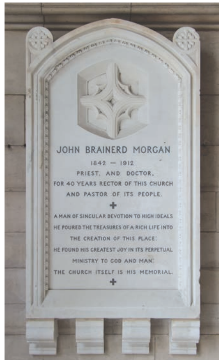
CLEANED OF ITS DUST AND REINSTALLED