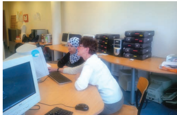
LEARNING COMPUTER SKILLS FROM CATHEDRAL VOLUNTEERS