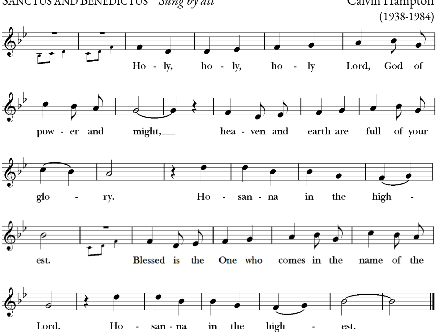
The Eucharistic Prayer continues

Blessed are you, gracious God, creator of the universe and giver of life. You formed us in your own image and called us to dwell in your infinite love.